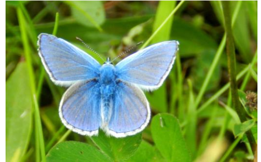
The common blue butterfly