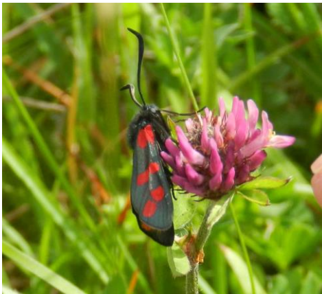
Six-Spot Burnet moth

Hundreds and hundreds of Common Blue butterflies were taking advantage of the summer sunshine, rising in clouds. The butterflies like Bird's Foot Trefoil and there is plenty of that in the meadow.